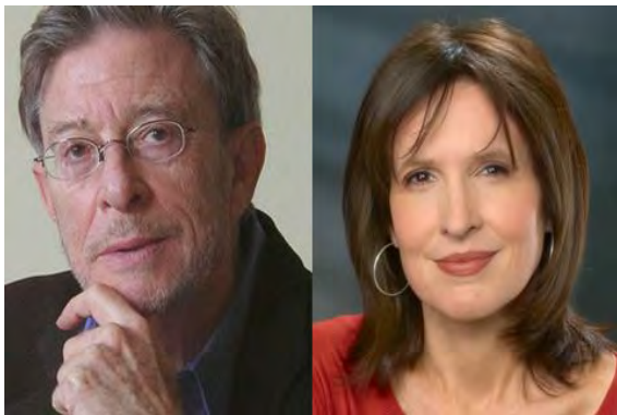
Open lecture by prof. Princeton University and New York University's Stephen Cohen and editor of the magazine The Nation Katrina Vanden Heuvel