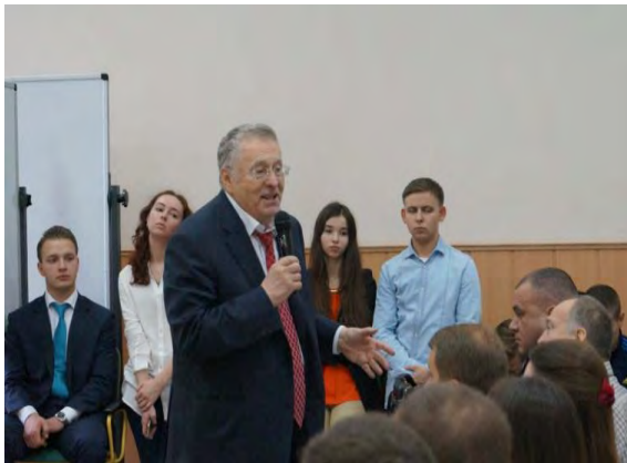
MP, LDPR Party Leader V. Zhirinovskiy gives speech at the faculty