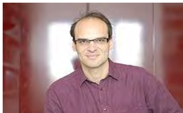
Public speaking sociologists from the University of Bordeaux in the sociology department